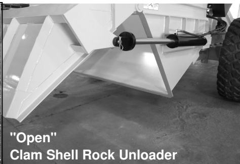
"Open" Clam Shell Rock Unloader

Rock picking made easy. Collecting and removing rocks and debris is only part of the story. Recycling those unwanted rocks for useful needs such as landfill, water control (riff-raff rock shoring), road-building, landscaping - just to name a few. Harvesting rocks can and will turn the rockpicking operation into a income instead of an expense. There is a large need for custom rockpicking.