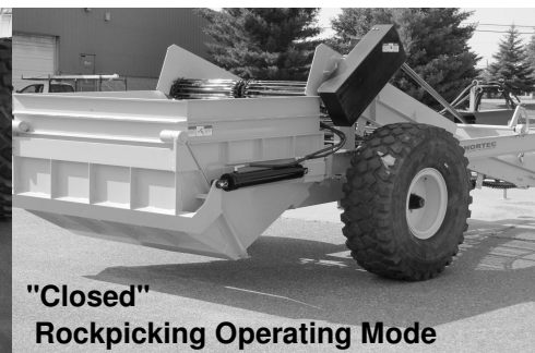
"Closed" Rockpicking Operating Mode

Attachment Modular Design: Attachment are easy on easy off design. This offers the customer several benefits. 1) Making servicing easy and quick, if there a need to repair the rockpicker and removing the attachment out of the way makes a job easier and faster this modular design allows for easy servicing. 2) Allows the customer to switch attachment such as going from box to conveyor boom.